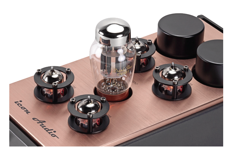
Two low noise ECC88 (6922) twin-triodes per channel provide gain, and a big 6SN7 acts as a low impedance line driver. Input transformers at right step up the MC input. MM goes in direct.

usage, but valve MC phono stages in particular are difficult to make quiet and I had to run through hum issues before listening could begin. Turning volume on the Creek amplifier up to maximum, with PS3 volume preset to maximum, threw up a nasty