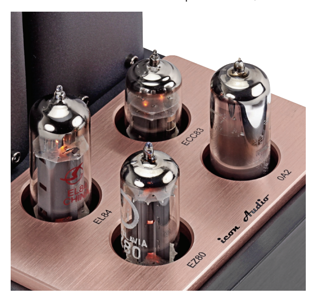
The power supply uses an EZ80 valve rectifier, OA2 voltage stabiliser and both EL84 and ECC83 as voltage regulators.

Firstly, hum and noise. The PS3 MkII was quiet under test, before