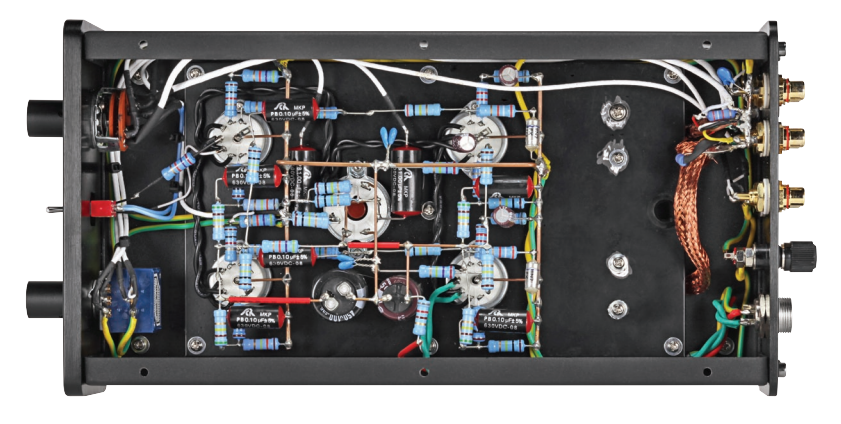
Inside the PS3 MkII preamp all parts are hard wired into place, in traditional fashion – and it sounds best. Note the use of a high quality, long-life Alps Blue volume control at bottom left in the picture.

Anyway, such issues apart, the PS3 MkII sounds as if it might be large and imposing, but it isn't. The preamp itself measures 148mm wide, 342mm deep and 165mm high, so it occupies little space and can sit beside a turntable; weight is 4kgs. Because it possesses no hum