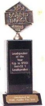
IMAGE 2 SPEAKERS

Image 1 speakers are available in your choice of mahogany or black genuine timber finish.