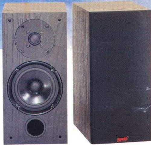
IMAGE 1 SPEAKERS

"After a blind testing session with a mixed panel of hi-fi initiates and naive listeners, not one would credit that such full-range, mellow and involving music could issue from such tiny boxes.