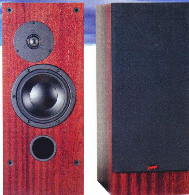
IMAGE 3 SPEAKERS

"Imaging is solid and well-formed; everything is exactly where you expect it to be on the sound stage - no matter whether you play the recording loud or soft."