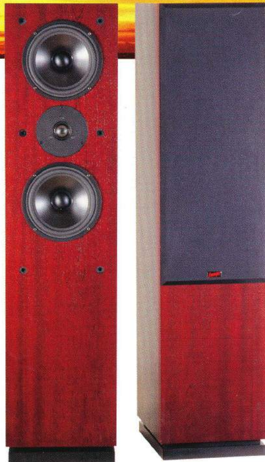
IMAGE 5 SPEAKERS

i mage 5 is a unique two-way floorstanding speaker design with many innovative features. Slim and elegant, this speaker will delight you for years to come with its precise sound quality and attractive finish.