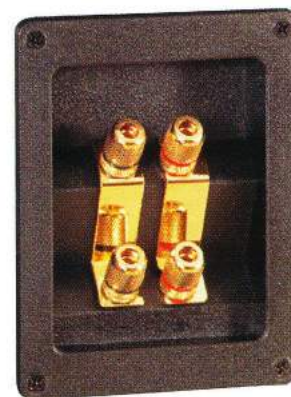
All Image of Australia speakers feature chunky solid brass input terminals. All Image Speakers (except Image 1) feature two sets of connectors, allowing for optional bi-wiring or bi-amping. Use your preferred connectors: banana plugs, spade lugs, bare wires or soldered ends. Gold plated connectors ensure premium sound quality and maximum longevity.

No expense or effort has been spared in the development and construction of Image of Australia loudspeakers. We have done our best to ensure that these speakers will provide you with years of musical pleasure - the choice is up to you.